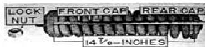
Fig. 44 — View showing the pre-load setting of the tension spring on models 440IC and 440ICD. Refer to text.