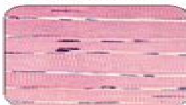
Skeletal Muscle (130 \times )

Figure 36-6 There are three types of muscle tissue: skeletal, smooth, and cardiac. Skeletal muscle cells have striations, or stripes, and many nuclei. Smooth muscle cells are spindle-shaped and have one nucleus and no striations. Cardiac muscle cells have striations and usually only one nucleus.