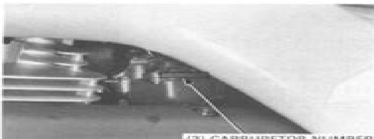
(3) CARBURETOR NUMBER

(2) The engine serial number is stamped on the rear half of the upper crankcase, viewed from the left side.