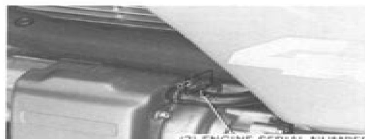
(2) ENGINE SERIAL NUMBER

(1) The frame serial number is stamped on the front of the frame.