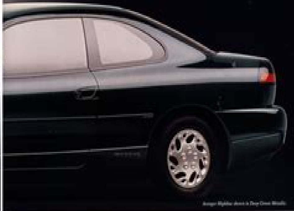
Average Highline shown in Deep Ocean Metallic.