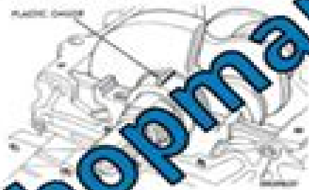
Fig. 5 Measure Crankshaft Journal O.D.

CAUTION: Do not rotate crankshaft or the plunger will be damaged.