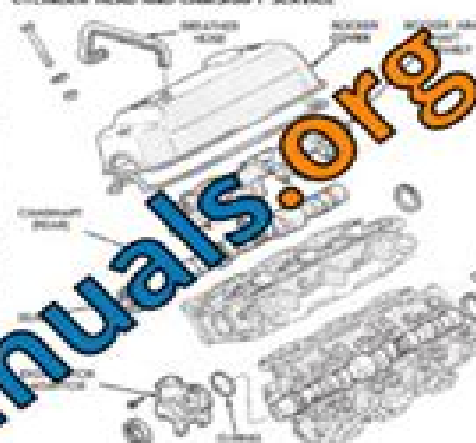
Fig. 1 Cylinder Head/Camshaft Valves