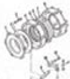
© 2004 Blackwell Publishing Ltd, Journal of Internal Medicine 255: 105–112

When installing a self-protection alarm system, there are several steps that should be followed. First, the alarm should be tested to ensure that it is working properly. Second, the alarm should be installed in a location that is easily accessible. Third, the alarm should be tested again to ensure that it is working properly. Finally, the alarm should be tested again to ensure that it is working properly.