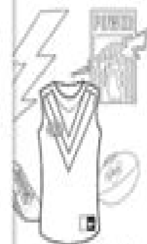
Port Adelaide Power