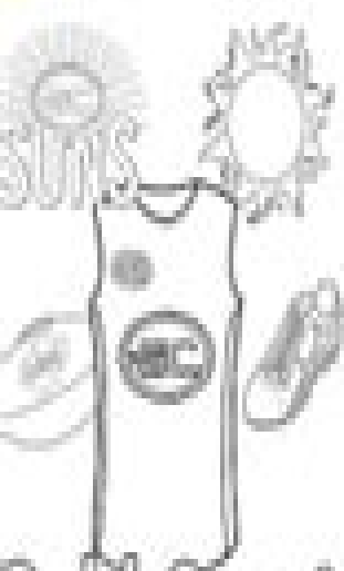
Gold Coast Suns