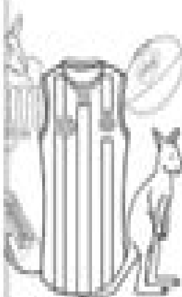
North Melbourne Kangaroos