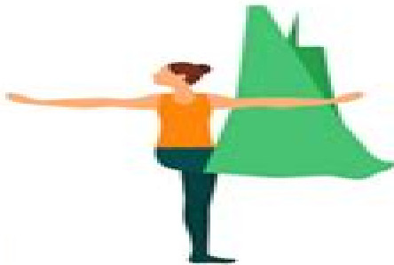
ASSISTED HAND TO TOE