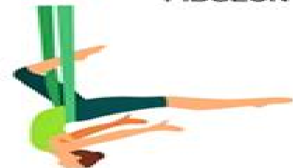
STRAIGHT LEG DANCER