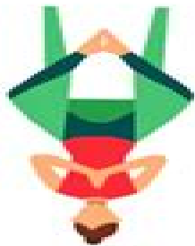
WIDE SEAT INVERSION