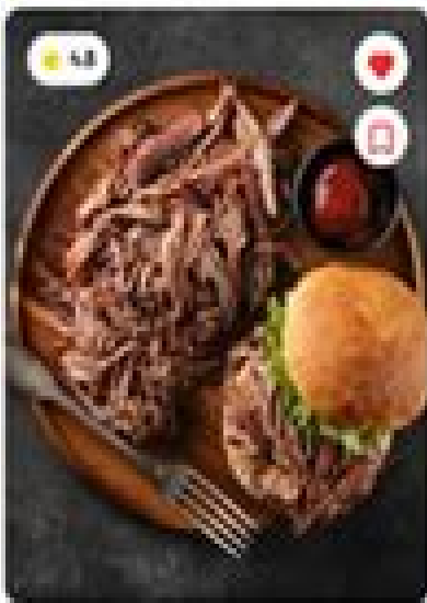
Meat Smoky Barbecue Pulled Beef Sandwiches