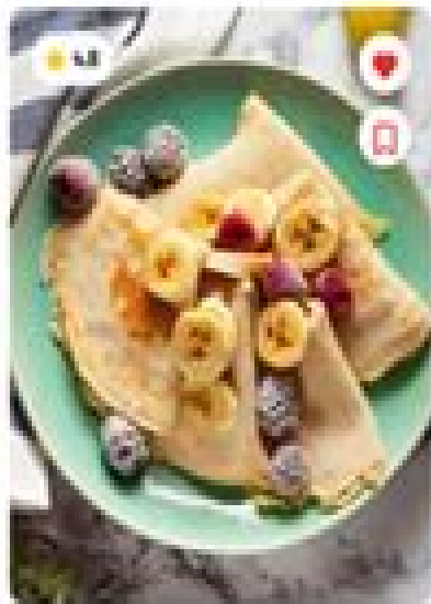
Breakfast Fluffy Banana Pancakes with Maple Syrup