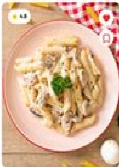
Pasta Creamy Garlic Mushroom Penne Pasta