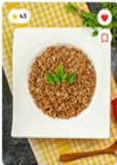
Salads Zesty Lemon Quinoa with Fresh Herbs