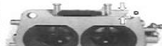
Fig. S218-2—Float height (D) should be 9.5-11.5 mm (0.37-0.45 in.). Bend tang on float arm to adjust.