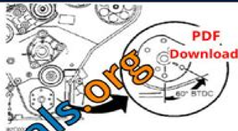
Timing Crankshaft At 60 Degrees BTDC