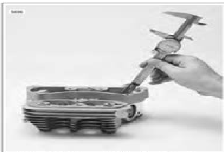
Figure 3-55. Measuring Valve Stem Protrusion