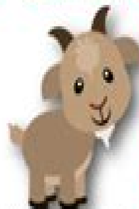
Big Billy Goat Gruff