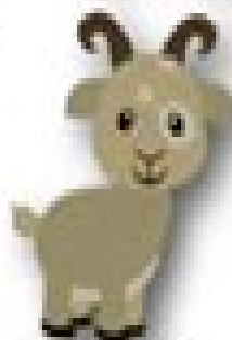
Middle-sized Billy Goat Gruff