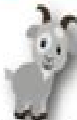
Little Billy Goat Gruff