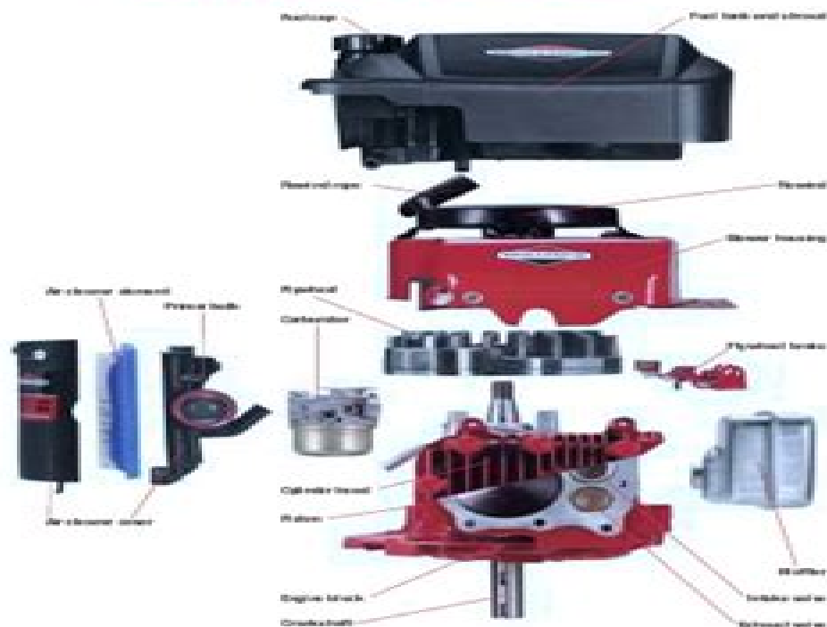
Part 1 of the August meeting – Great ideas