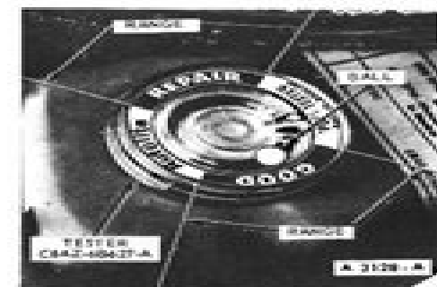
FIG. 4—Crankcase Ventilation System Tester—Typical

If the loping or rough idle condition remains when the good regulator valve is installed, the crankcase ventilation regulator valve is not at fault.