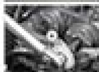
Engine compartment view, showing location of the main fuse block