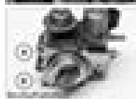
View of the engine block, showing location of the main fuse block