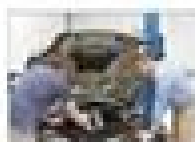
Engine compartment view, showing location of the main fuse block

Though the do-it-yourself MINI owner will find this manual indispensable as a source of detailed maintenance and repair information, the owner who has a limited understanding of this or that car will find that reading and viewing this manual makes it possible to discuss repairs more intelligently with a professional technician.