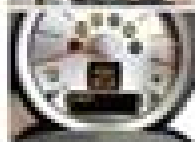
View of the instrument cluster, showing location of the main fuse block