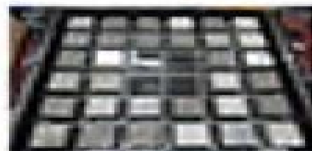
(b) Longitudinal reinforcement