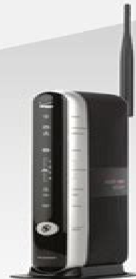
MI424WR Rev. E

Verizon's FiOS router features an advanced hardware design including an industry-first 64-bit, dual core processor. The router's 64-bit architecture provides a substantial performance improvement over the 32-bit devices sold today. The router's latest MIPS core offers further performance improvement and