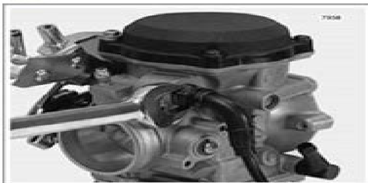
Figure 4-6. Remove Enrichener Cable