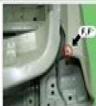
Front panel outer corner