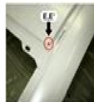
Front panel front corner