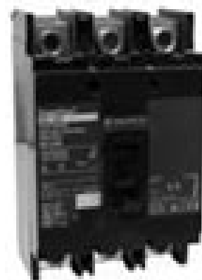
Example main breakers