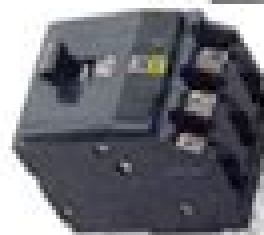
Example 3-pole breakers