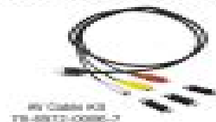
AV Cable Kit 78-6012-0000-7