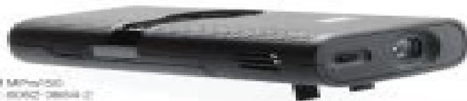
3M MPro150 38-6042-0000-2