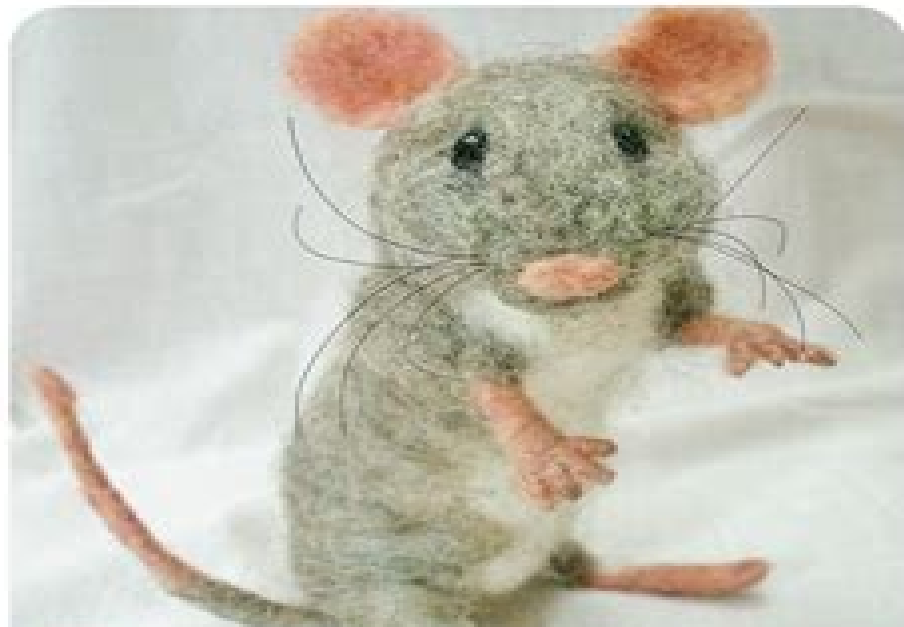
3D Needle Felting Workshops