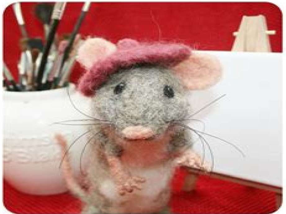
Working With A Wire Armature