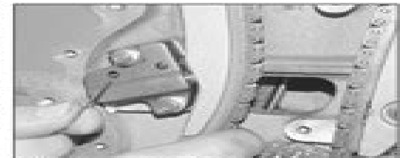
10.4 Press against the timing chain guide and insert a locking pin (approximately 1.5 mm)

7 If required, unbolt the fixed timing chain guide and withdraw the tensioner timing chain guide from its pivot pin on the cylinder head (see illustrations).