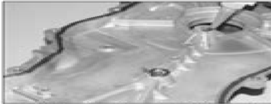
9.13a Apply a 3.0 mm bead of sealant around the timing chain cover, including the inner bolt holes.

12 Unscrew the timing chain cover retaining bolts (noting their positions for refitting) and withdraw the cover from the engine.