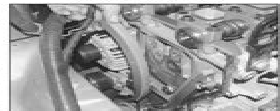
10.7a Withdraw the tensioner guide from the pivot pin ...