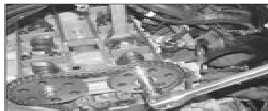
10.6 Using a spanner to hold the camshafts, while undoing the retaining bolts