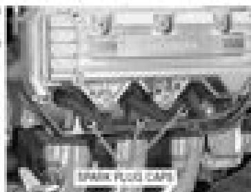
SPARK PLUG CAPS

Disconnect the spark plug caps and remove the spark plugs.