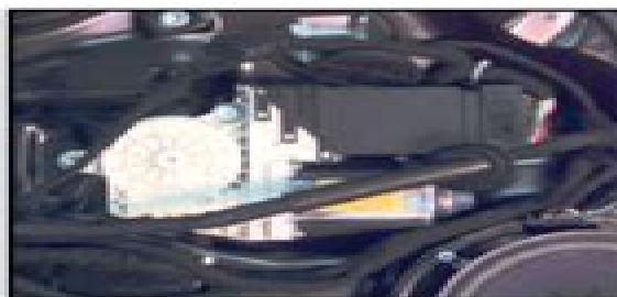
J386 Door control module, driver side