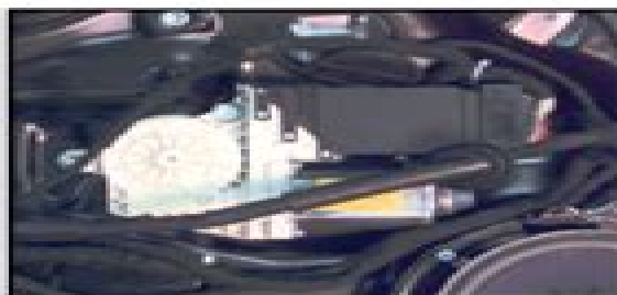
J387 Door control module, passenger side