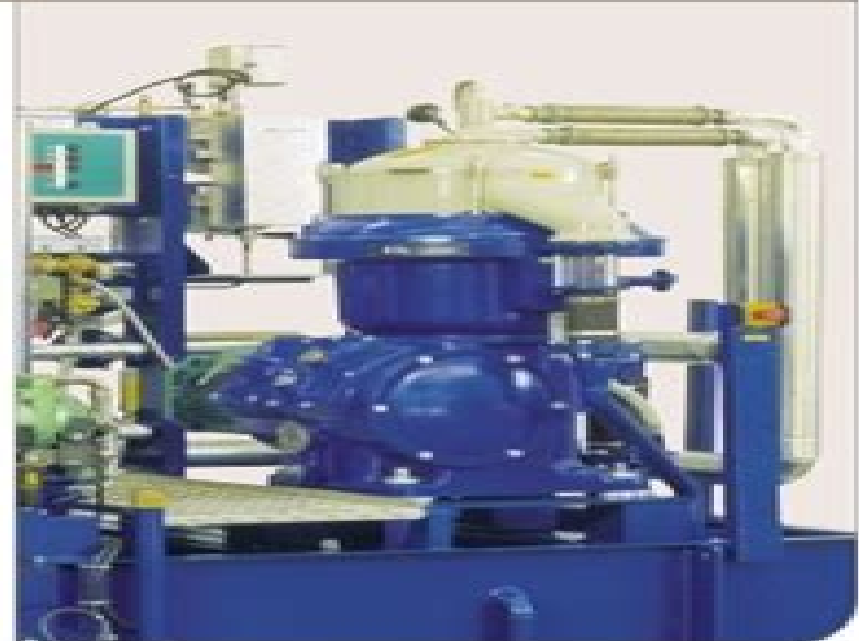
Fig. 1. MOPX separator system.