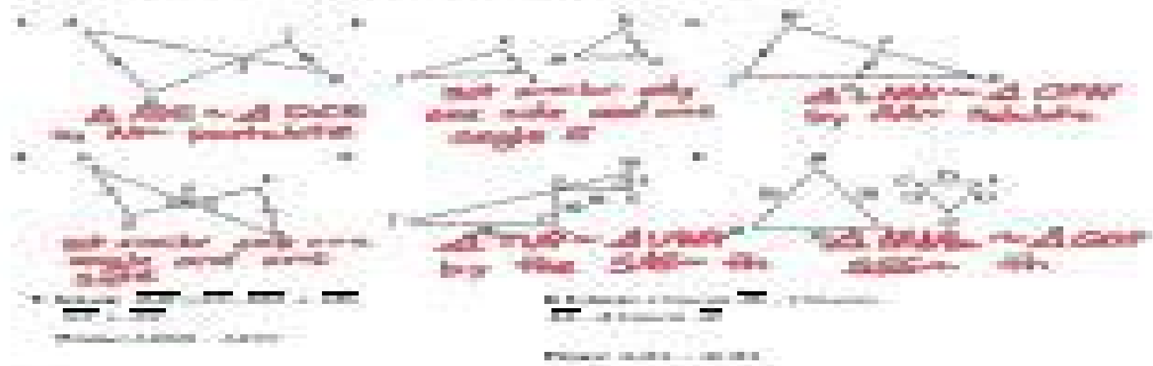
Illustration shows the 3 triangles that make up the figure. Identify the triangles, and write the conditions of congruence you would use to prove them.