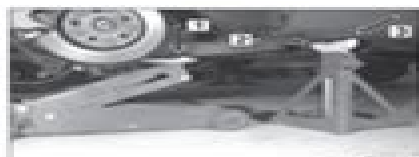
Proper positioning of floor jack and jack stand to lift vehicle safely. 03 Maintenance