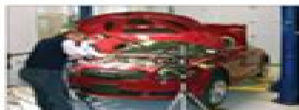
Bentley technical editor working on a TT Roadster.

Although the do-it-yourself Audi owner will find this manual indispensable as a source of theory of operation and step-by-step maintenance and repair information, the Audi owner who has no intention of working on his or her car will find that reading and owning this manual will make it possible to discuss repairs more intelligently with a professional technician.