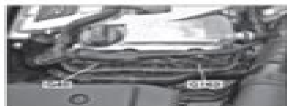
Location of ignition components on 3.2 liter engine. 28 Ignition System