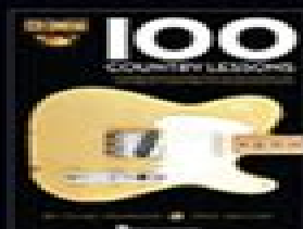
100 COUNTRY LESSONS (HL00696-453)