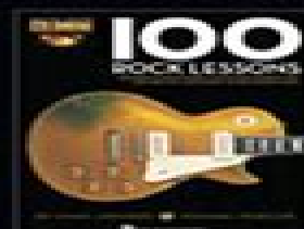
100 ROCK LESSONS (HL00696-453)