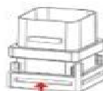
Steps C-F – Clean Windows