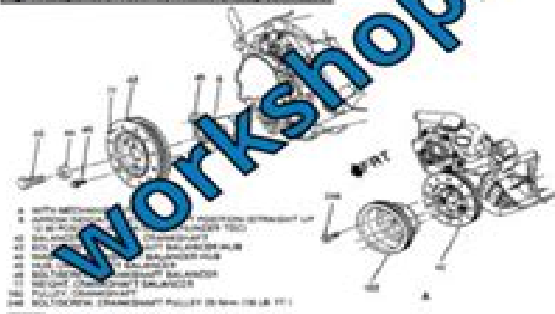
Fig. 6: Identifying Crankshaft Balance Assembly & Bolt (With Fan Belt Pulley)