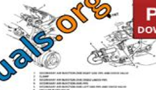
Fig. 18. Identifying Speaker's Aid Selection From Components (1 Of 2)