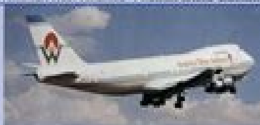
©2007 Pearson Education, Inc. All rights reserved. No part of this publication may be reproduced, stored in a retrieval system, or transmitted, in any form or by any means, electronic, mechanical, photocopying, recording, or by any information storage or retrieval system, without permission in writing from Pearson Education, Inc., or its authorized representative.

Below: Chromolaena (the "tree of life") is a common weed in India. It is the first tree with a taproot of 10 cm in the third year, and a taproot of 10 cm in the third year.