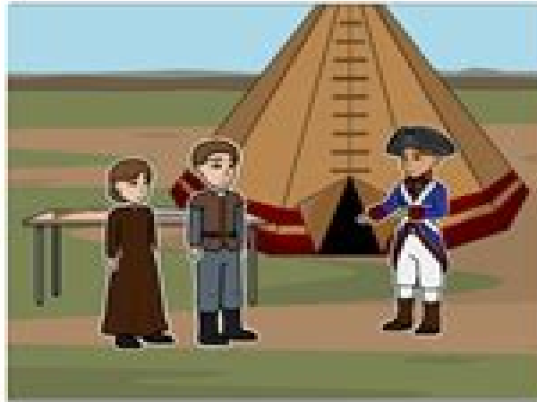
Getting ready for war

I wasn't sure what I was going to do but I knew I had to be there for my brother, so the guy in charge told me I could help with any medical things and make food for the soldiers.