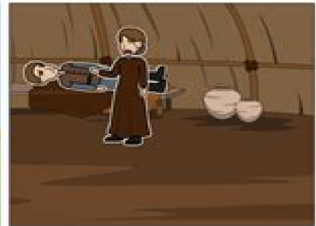
when it all ended..... for me

We all tried everything we could but nothing was working and next thing I knew he is not breathing and I knew he was gone. I tried to keep myself together but I couldn't, I broke down right there.