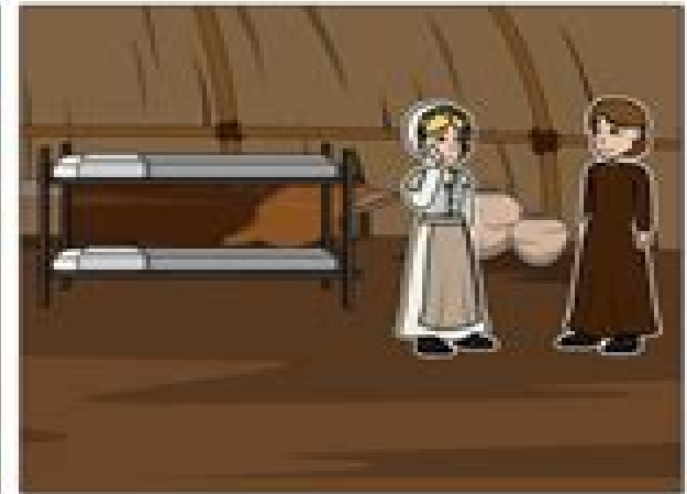
Learning how to do the work

I go into a tent and a woman is there telling me everything I need to know, she just hoping that nothing will happen to my brother.