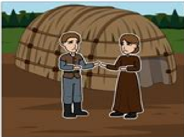
Talking to my brother before it all starts

I met up with my brother to talk to him about how everything is going to be ok and when this is all over we would go home and have the best meal of our lives.