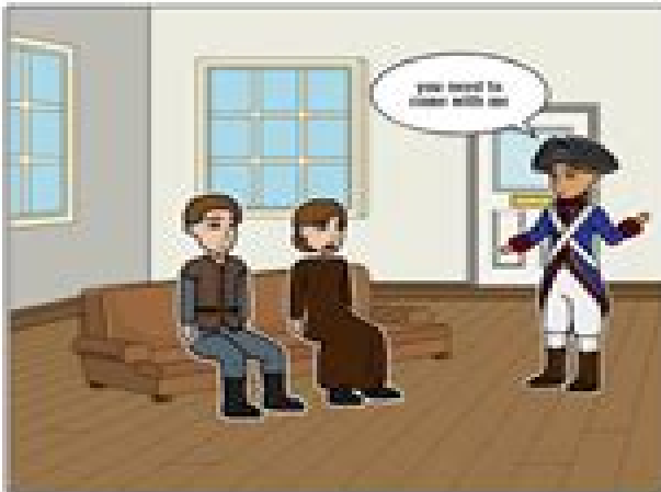
When it all started

I was just at home one day and my brother was being taken to fight in the war and I could not just let him go on his own so I went to help.