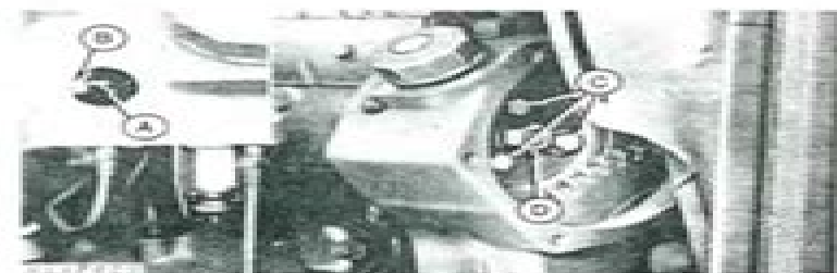
A—Drive Hub Mark B—Pointer Mark

5. If timing is correct, replace plugs and reconnect hose.