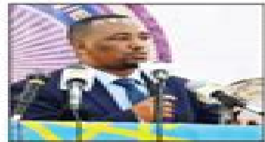
የደቡብ ሱዳን ታጣቂዎች በደቡብ ምዕራብ ኢትዮጵያ ክልል የወርቅ ማውጫ እካባቢን መቆጣጠራቸው ተሰማ

የደቡብ ሱዳን ታጣቂዎች በደቡብ ምዕራብ ኢትዮጵያ ክልል የወርቅ ማውጫ እካባቢን መቆጣጠራቸው ተሰማ የደቡብ ሱዳን ታጣቂዎች በደቡብ ምዕራብ ኢትዮጵያ ክልል የወርቅ ማውጫ እካባቢን መቆጣጠራቸው ተሰማ