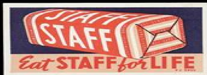
49-date unknown, hinged, 5.50