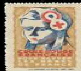
50-1940s war, mnh, 5.50 51-Swiss TB, mnh, 2.00 52-Czech, ng 5.00 53-Fr RC, '47, h, 3.00