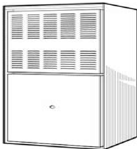
Upflow / Horizontal*