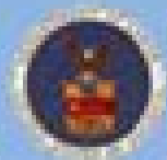
Department of Labor