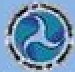
Department of Transportation