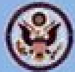
Department of State