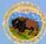
Department of the Interior