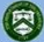
Department of the Treasury