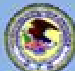
Department of Justice