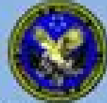
Department of Veterans Affairs