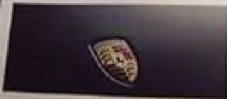
Security and Comfort