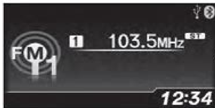
Audio/ Information Screen