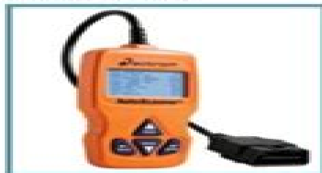
Actron AutoScanner CP9575