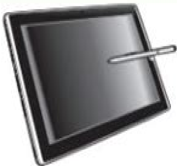
Eee Slate and Digitizer Pen