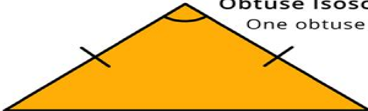
Obtuse Isosceles Triangle