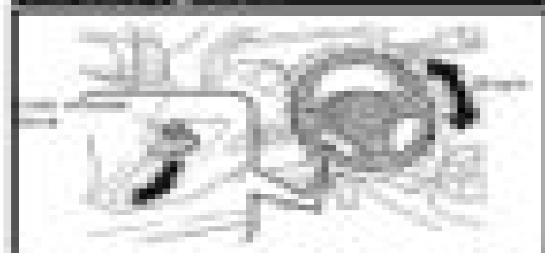
© 2004 Blackwell Publishing Ltd Journal of Internal Medicine 255: 103–110