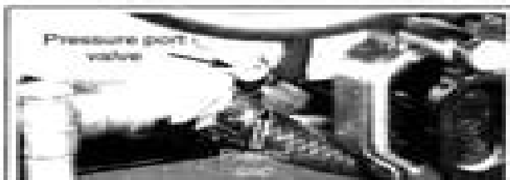
Fig. 14 Fuel pressure can be depressurized at the pressure port valve. Always use extreme caution while working around fuel under pressure.