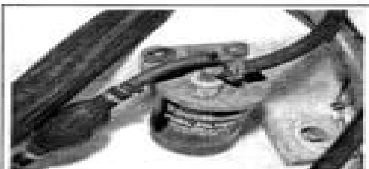
Fig. 13 Typical in-line fuel filter installation.

In addition to the fuel filter mounted on the engine, a filter is usually found inside or near the fuel tank. Because of the large variety of differences in both portable and fixed fuel tanks, it is impossible to give a detailed procedure for removal and installation. Most in-tank filters are simply a screen on the pump-out line inside the fuel tank. Filters of this type usually only need to be cleaned and returned for service. Fuel filters on the outside of the tank are typically of the inline type and are replaced by simply removing the clamps, disconnecting the hoses and installing a new filter. When installing the new filter, make sure the arrow on the filter points in the direction of fuel flow.