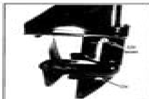
Fig. 11 The lower unit is fitted through the oil plug and allowed to rise through the case for the oil level plug. This is done to allow any trapped air to escape.