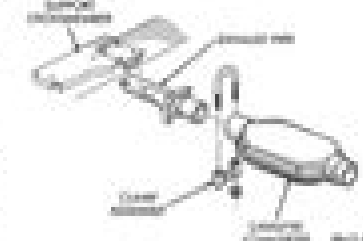
Fig. 7 Exhaust Pipe-to-Catalytic Converter Connection

apply heat until the metal becomes cherry red. Do not remove the exhaust pipe from the catalytic converter (Fig. 5). Remove the exhaust pipe.