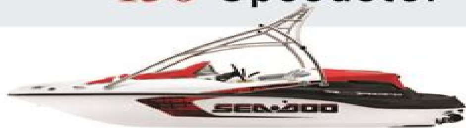
150 Speedster w/optional lower plate