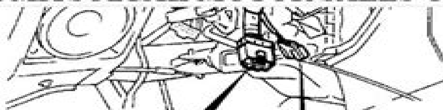
Fig. 2: Testing Ignition Switch & Key Reminder Switch Courtesy of MITSUBISHI MOTOR SALES OF AMERICA.