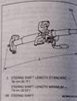
Figure 25.4.5.1 Measuring Spring Shaft

Spring column length: Standard - 780 mm (30.71 in.) Minimum - 770 mm (30.31 in.)