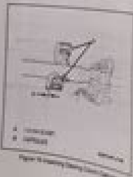
Figure 25.4.1.1 Checking Steering Column Damage